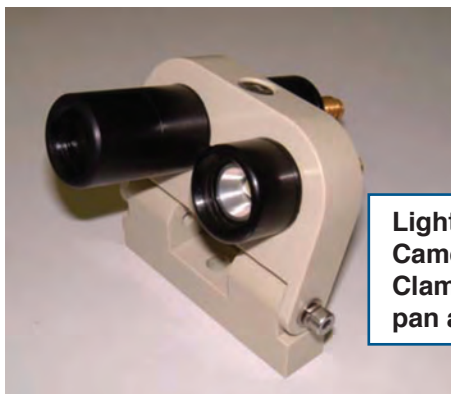
Light (AC-LED-001A) with Camera (AC-CAM-001A) Clamped in polypropylene pan and tilt bracket