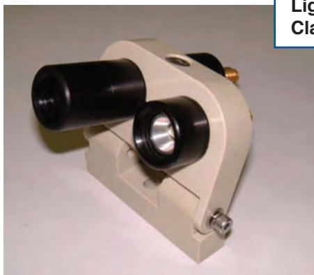
Light (AC-LED-001A) with Camera (AC-CAM-001A) Clamped in polypropylene pan and tilt bracket